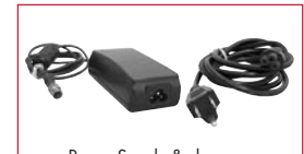
Power Supply & charger