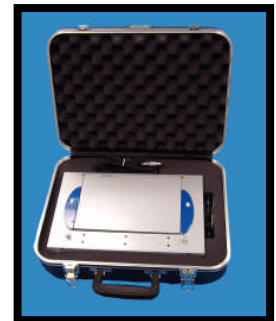
Optional Travel Case Measures just 16" x 13" x 5.5"